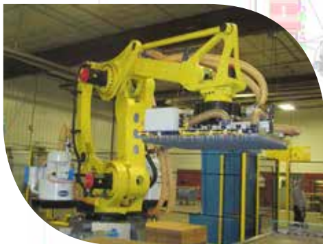
High-speed | Pick-and-place | Sorting | Inter-plant routing