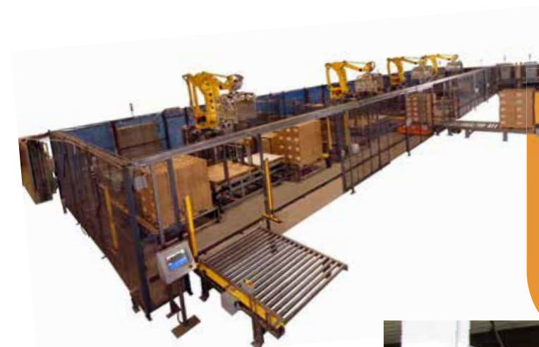
Great for applications palletizing cases, bundles, bags, or large objects with complex patterns